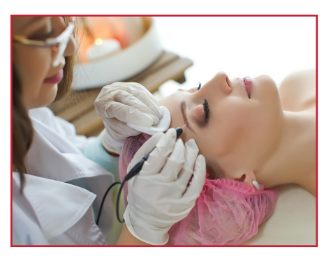
Handle all sharp instruments carefully and wear protective gloves.