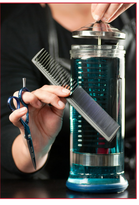
Disinfect tools properly after use.

Hepatitis B and hepatitis C are caused by two different viruses. Although each can cause similar symptoms, such as fever, fatigue, loss of appetite, nausea, vomiting, dark urine, abdominal pain, and jaundice (the eyes and skin turn yellow), they have different modes of transmission and treatments. It is possible to have both hepatitis B and C infections at the same time.