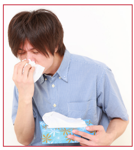
Many respiratory diseases can be spread through the air when an infected person coughs, sneezes, or spits.

Another way a communicable disease may be contracted is through water or food. Individuals may swallow water or food that has been contaminated by feces. Many harmful organisms live in the intestine and leave the body in the stool. For example, feces may contain bacteria or viruses that cause diarrhea. The organisms in feces can be spread if someone goes to the bathroom, does not wash their hands, and then handles food. Some diseases spread this way are salmonella, hepatitis A, and polio.